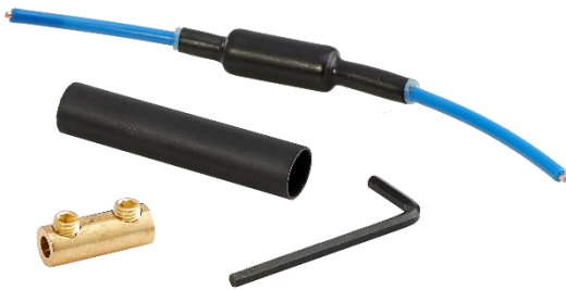
In-line Splice SC-PB-01