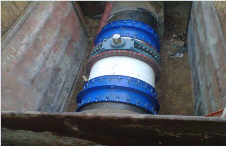
An example of one of our special transition couplings that connects varying sizes of concrete, steel, and ductile pipes.

Pipelines built today with low-maintenance steel reinforced concrete pipe should last for over 100 years. So for projects designed with life cycle costs in mind, concrete pipe is a category that easily falls within sustainability parameters meeting the needs of the present generation, without compromising the needs of future generations. Smith-Blair has substantial experience working with and fabricating fittings for various types and sizes of concrete pipelines. Your Smith-Blair sales representative has the support of a highly experienced team of engineers, designers and fabrication specialists to help. They are backed by a professional support staff and logistics team to ensure jobs large and small are precisely designed, estimated, approved and built to exact specifications. The finished parts are then shipped efficiently and cost effectively from our centrally located 261,000 square foot plant in Texarkana, AR to your job site. Let a Smith-Blair expert help you work on the fitting solution to your next project with concrete pipe.