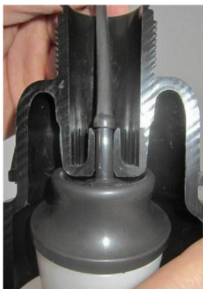
(Upper air valve part in cut sample view)